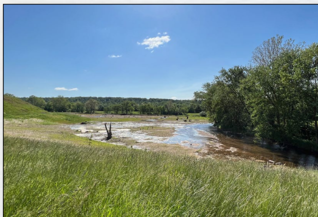
Conewago Creek restoration project